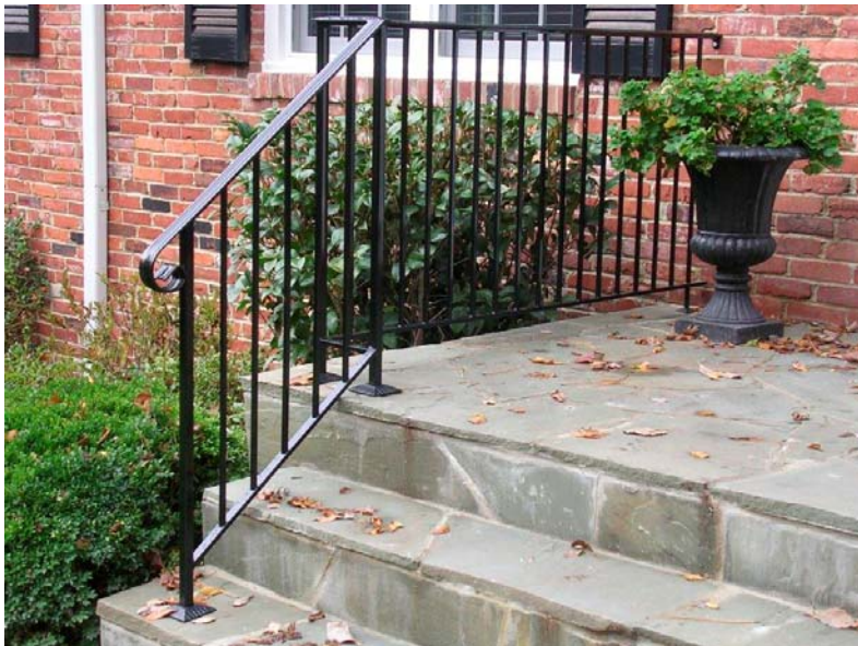
Figure 2 – Similar Handrail to Churchill Square